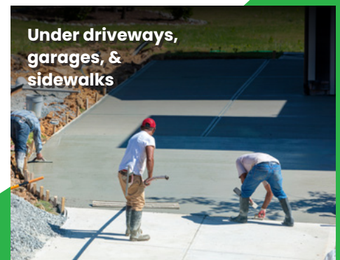
Under driveways, garages, & sidewalks