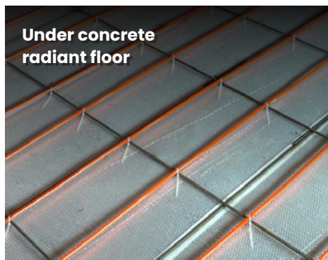
Under concrete radiant floor