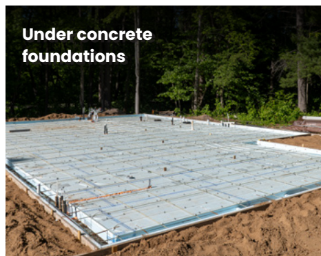
Under concrete foundations