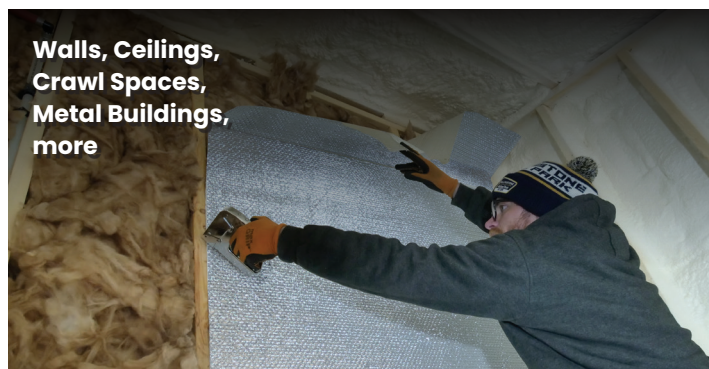
Walls, Ceilings, Crawl Spaces, Metal Buildings, more