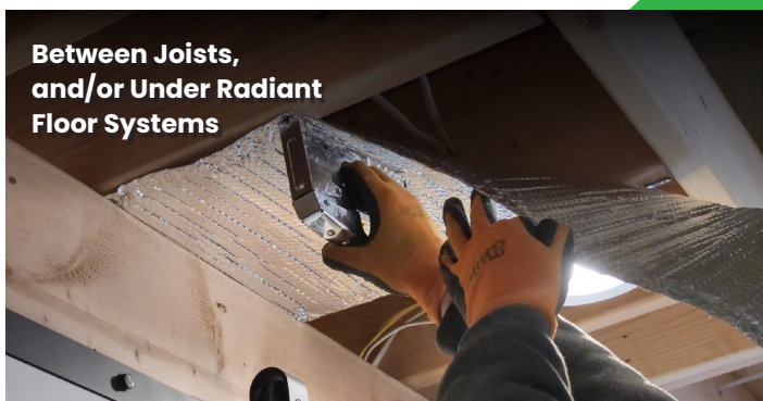
Between Joists, and/or Under Radiant Floor Systems