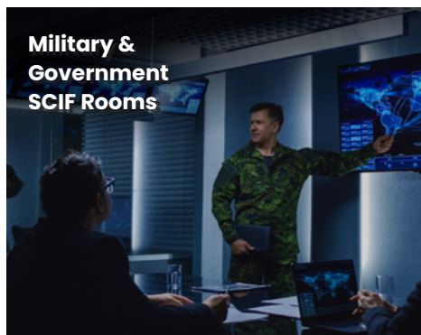
Military & Government SCIF Rooms