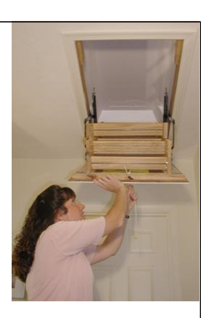
Draft Cap is lightweight, and easily installed in minutes. Made of durable dust-free foam, Draft Cap covers the attic stair opening to prevent air flow, and meets all local and federal energy codes for insulation.